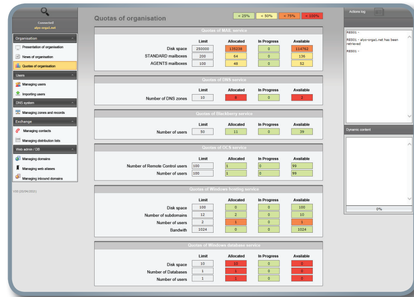
Overview of a Control Panel